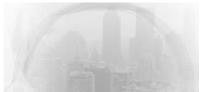
TABLE OF CONTENT